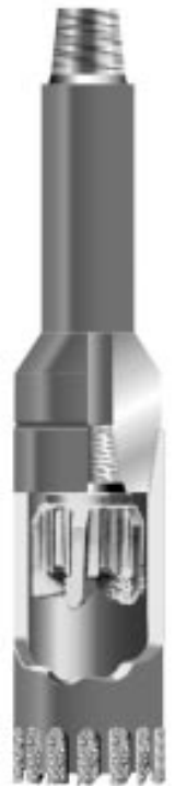
Skirted Mill Assembly